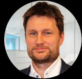
Hugo Strand Fitjar Mekaniske Verksted

Aurora 1000: LxB: 60 x 15 m. Fish hold cap: ab. 1000 m3.